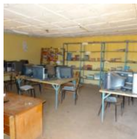
Dire Jato primary

We are not very satisfied with the condition in which we found the library because the university has donated old computers which have been dumped on the tables here without anyone knowing if they work. They are going to get technical help to check if the computers can be put to use. Meanwhile, we suggested they clear the tables so that the room can be used for study purposes. Another room in the building is a class for learning reading: